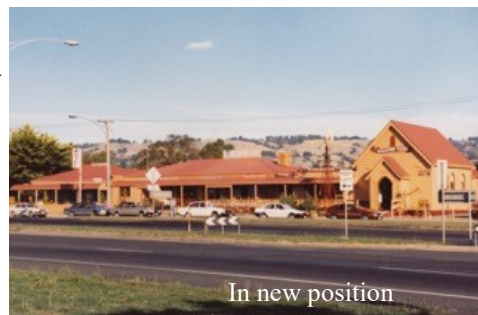
In new position