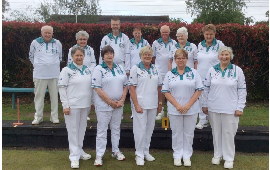
The Victorious Midweek team prior to winning against Moe.

Over the Australia day period on Wednesday 25 th open fours,