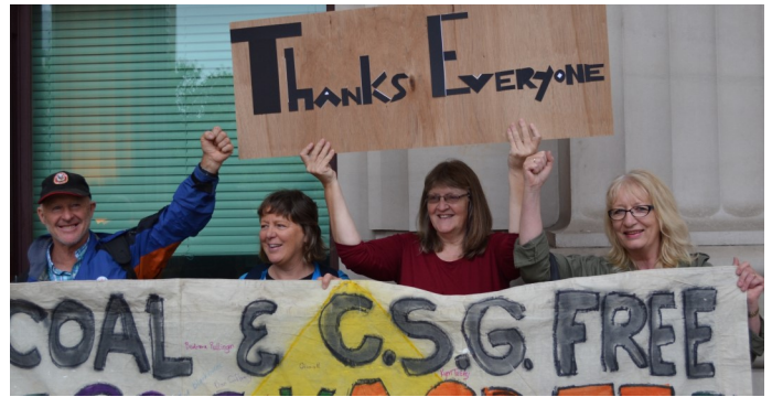
Farmers and community members from across the state came to Parliament House to see the legislation tabled.

"We produce the highest quality food which our customers